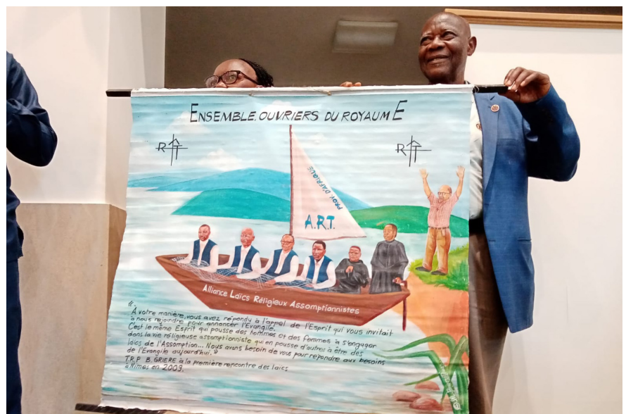
« We wanted to paint « Laborers of the Kingdom Together » on the occasion of the first meeting with the lay people in 2009 in Goma. »

The Assumption has not said its last word. If we live the Alliance in a resolutely Catholic spirit - bold, generous, selfless - we have before us an immense field to harvest. The workers of the Kingdom, religious and lay, are available: «Here I am, Lord send me!»