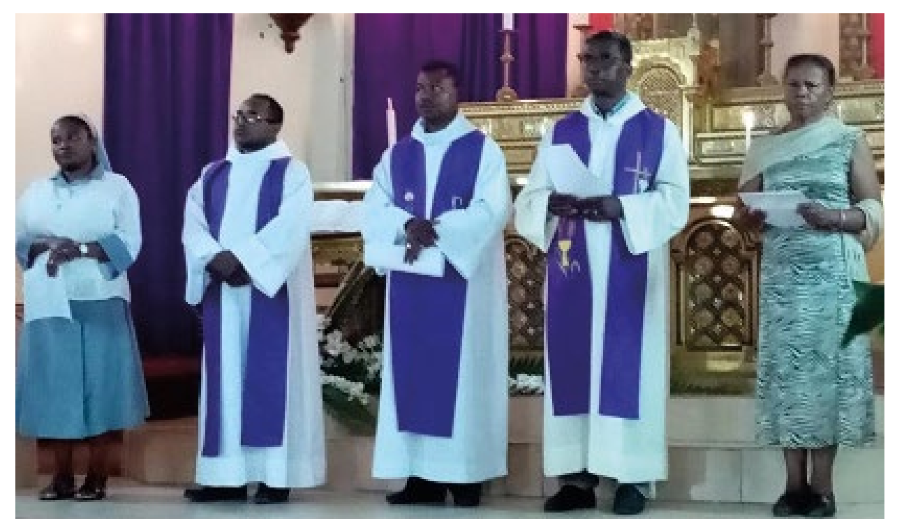
The installation celebration of the Special Tribunal.

interrogation would be conducted, or how we would be interrogated!... Happily, the bishop explained, simply and briefly, how the process would unfold, that is, that each witness would be called separately and alone to be heard before the Tribunal. So we planned the order in which each of the witnesses would be called. And to add to the solemnity of the occasion, each of us, including the members of the Tribunal, were invited to swear, with our hand on the Bible, and to sign a paper, committing ourselves personally, to this process, thus marking its serious and official tone.